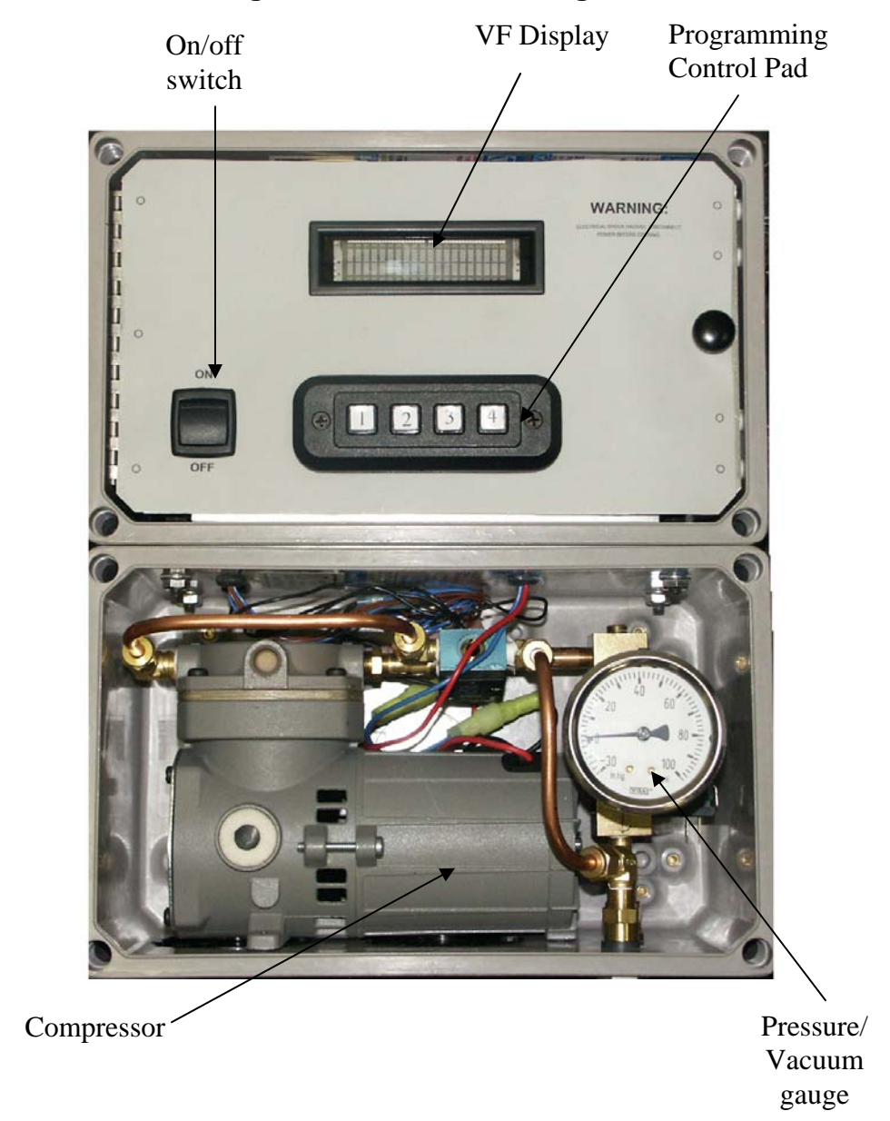
Figure 2 – Installation Diagram